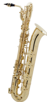
Sax + sax stand