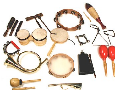
Percussion + 2 vocal mic stands