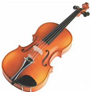
Violin + keyboard stand