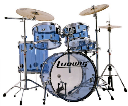
Drum Set + table